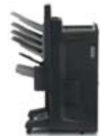
Multifunction finisher 6

Get a maximum output capacity of 1,200 pages while separating copy, print, and fax 7 jobs to different output trays. Two bins hold up to 400 pages each and two more hold up to 200 pages each.